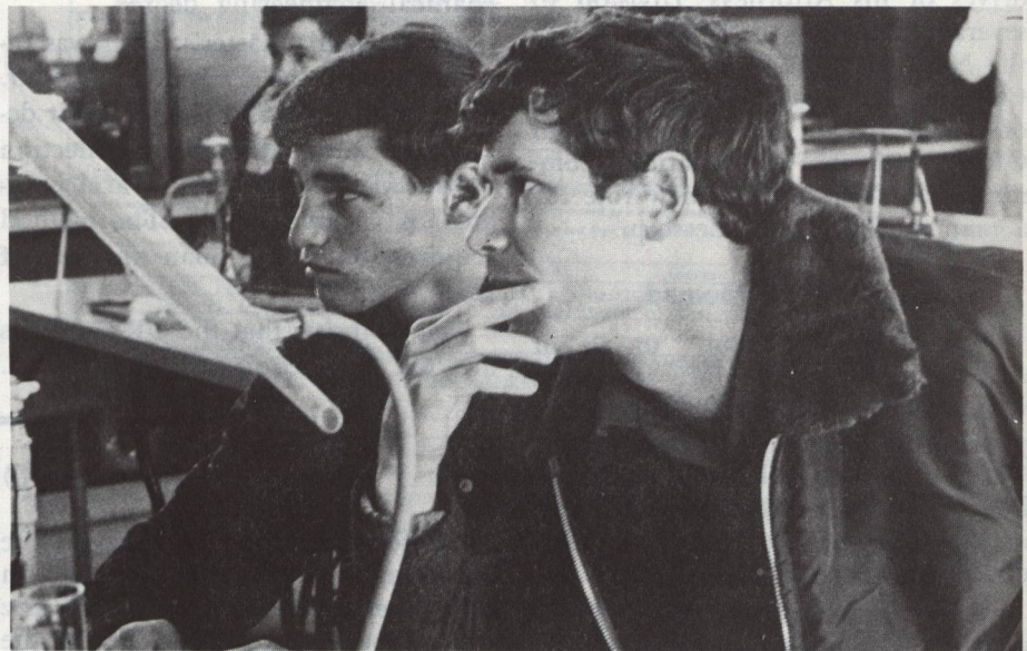
Demobilized veterans at the ORT Technical College in Nathanya.

In fact, that prognosis proved correct. Such programs are now in full swing.