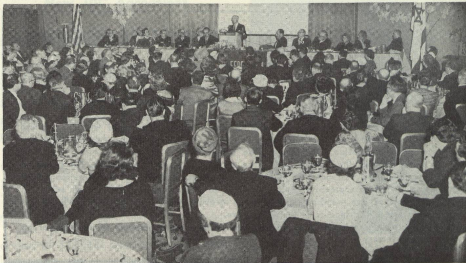
Part of the audience at the dinner session of the annual conference of the national Board of Directors, held at Hotel Roosevelt in New York.