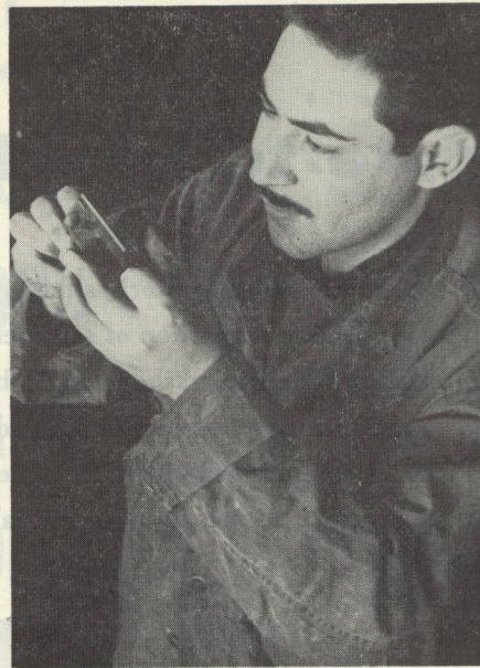
A TEACHER CHECKS his work at the Central ORT Institute for Teacher Training at Anieres, Switzerland.

REFUGEES. Some 10,000 Hungarian and Egyptian Jews, the residue of the refugee wave of last year, remain in temporary camps in Austria or in France and Italy. Special trade training pro-