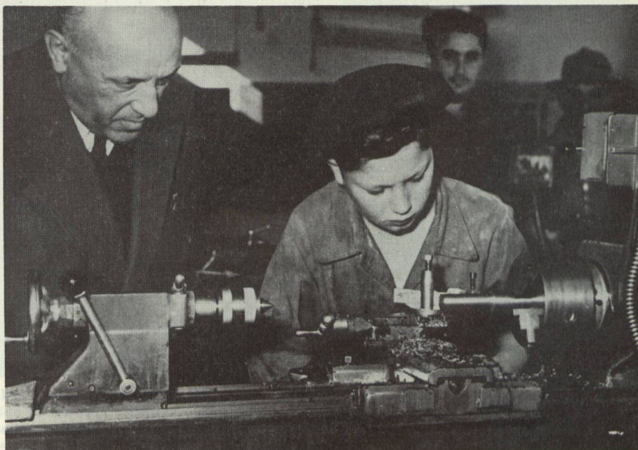
Israel's Minister of Labor, M. Namir, looks on as a youngster in the Machinists School at the Givatayim ORT Center turns a metal rod on a lathe.