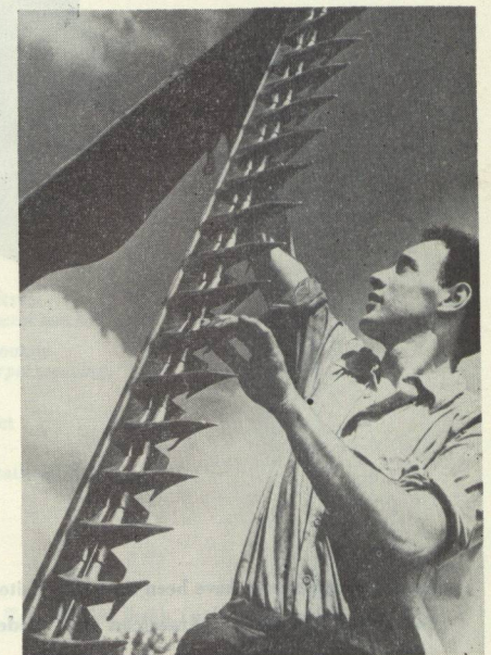
FUTURE AGRICULTURAL mechanic at the Nathanya ORT Center, Israel.

The basic condition for the performance of the rehabilitation and reconstruction work of ORT in the year ahead remains the moral and material support provided by American Jewry.