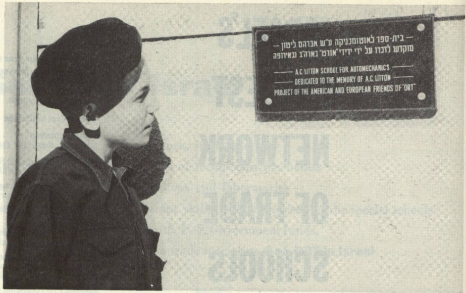
A newly enrolled student checks the name of the new A. C. Litton School for Auto-mechanics in Jerusalem. This school, which forms part of the extensive Jerusalem ORT Vocational Center, is now a project of the American and European Friends of ORT. Membership funds of the group are used to enlarge facilities and provide scholarships.