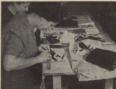
Glove Making Course in Paris

In North Africa our people live in indescribable ghetto conditions, their social status lower than that of the DP