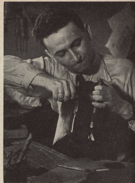
Leather Work at ORT School in Stuttgart

The spirit which animates our work will enable us to accept our responsibil-