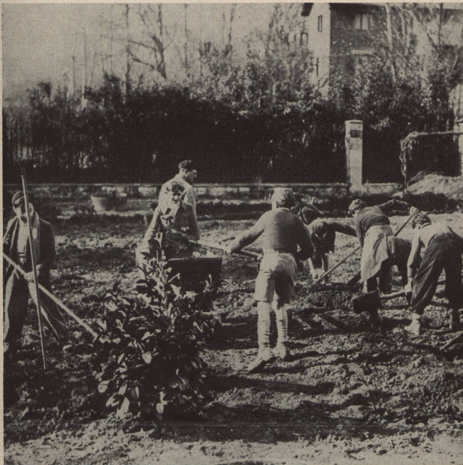
ORT Gardening Course for Youth at Maimonides School, Boulogne Sur Seine