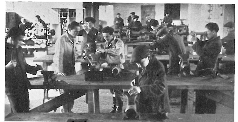
Machine Tool Workshop, Belsen.