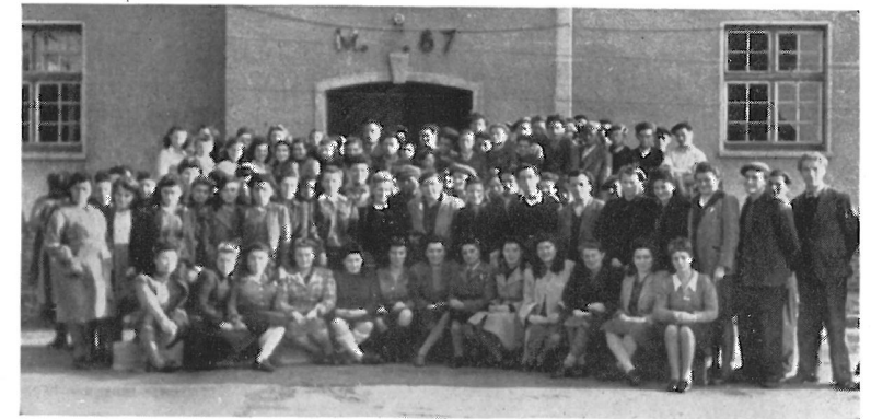
Students at O.R.T. School, Belsen.