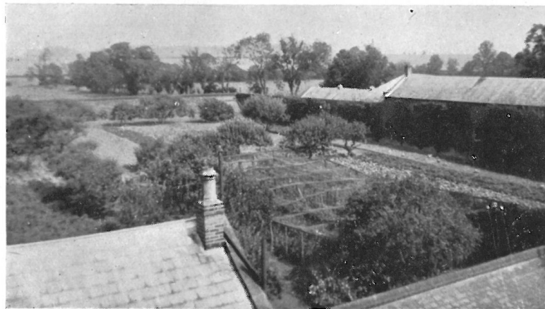
Section of Goldington Agricultural Centre, Bedford.