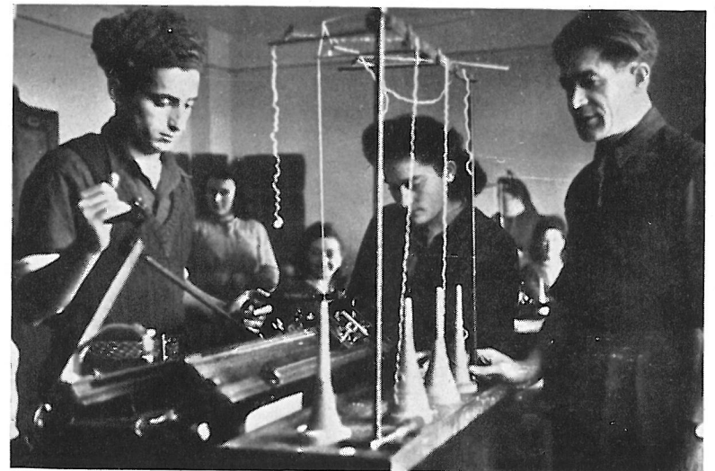
Mechanical Knitting Class, Belsen.