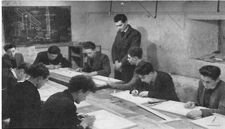
Future Draughtsmen—London O.R.T. School.